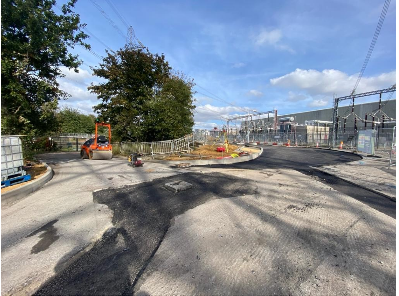
Sizewell B and C Nuclear Power Stations