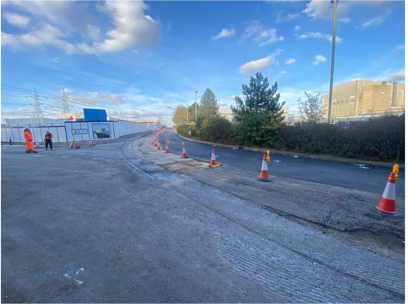
Sizewell B and C Nuclear Power Stations